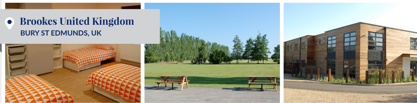
• Brookes United Kingdom BURY ST EDMUNDS, UK