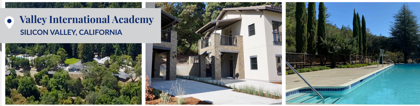
• Valley International Academy SILICON VALLEY, CALIFORNIA

The boarding residence is a home away from home. Dorm chaperones live in the residence, creating a comfortable, safe, family environment where students can study, socialize and work together.