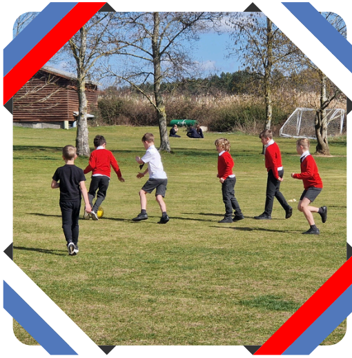
Lunch Time Play